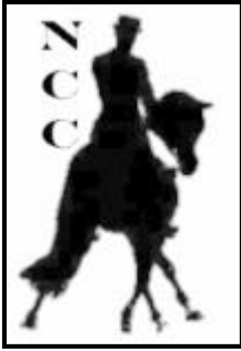
NCC of ODS 2008

The NCC of ODS is holding a membership meeting at the Pizza Hut in Ponca City, on Sept. 15th. We will have a talk about arena and show ground etiquette, and your personal horse trailer inspections. Happy Transitions Rainee B.Pres.