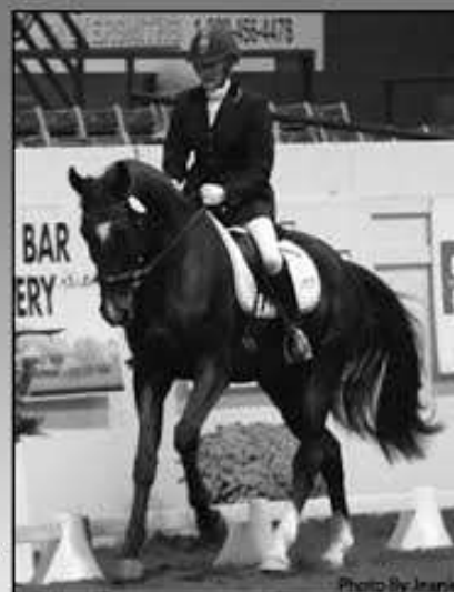
Oldenburg gelding "Rousseau" bred, trained and ridden by Anthea. 76% at Training Level, Great Plains and Open Training level Champion.